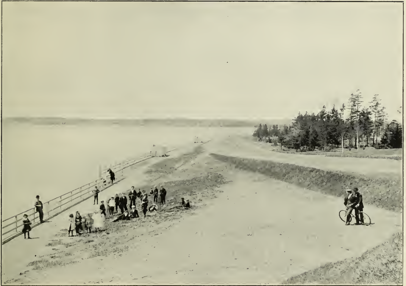
PARK ROADWAY, CHARLOTTETOWN.